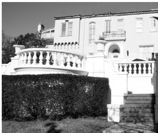
Casa Azul, Built in 1925